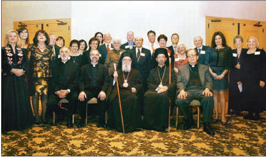
Members of St. Katherine's Church in Redondo Beach with Archbishop Demetrios and Metropolitan Gerasimos of San Francisco at the community's anniversary celebration.

METROPOLIS OF NEW JERSEY METROPOLIS OF PITTSBURGH METROPOLIS OF DENVER METROPOLIS OF DETROIT METROPOLIS OF NEW JERSEY OF BOSTON METROPOLIS OF CHICAGO METROPOLIS OF DENVER METROPOLIS OF DETROIT METROPOLIS OF NEW JERSEY METROPOLIS OF PITTSBURGH MET OF PITTSBURGH METROPOLIS OF SAN FRANCISCO METROPOLIS OF NEW JERSEY METROPOLIS OF PITTSBURGH MET METROPOLIS OF DENVER METROPOLIS OF DETROIT METROPOLIS OF CHICAGO METROPOLIS OF DENVER METROPOLIS OF ATLANTA METROPOLIS OF BOSTON METROPOLIS OF SAN FRANCISCO METROPOLIS